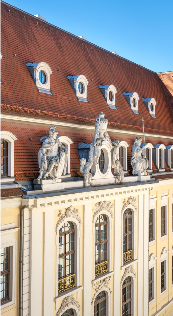
INNER COURTYARD HISTORIC FACADE