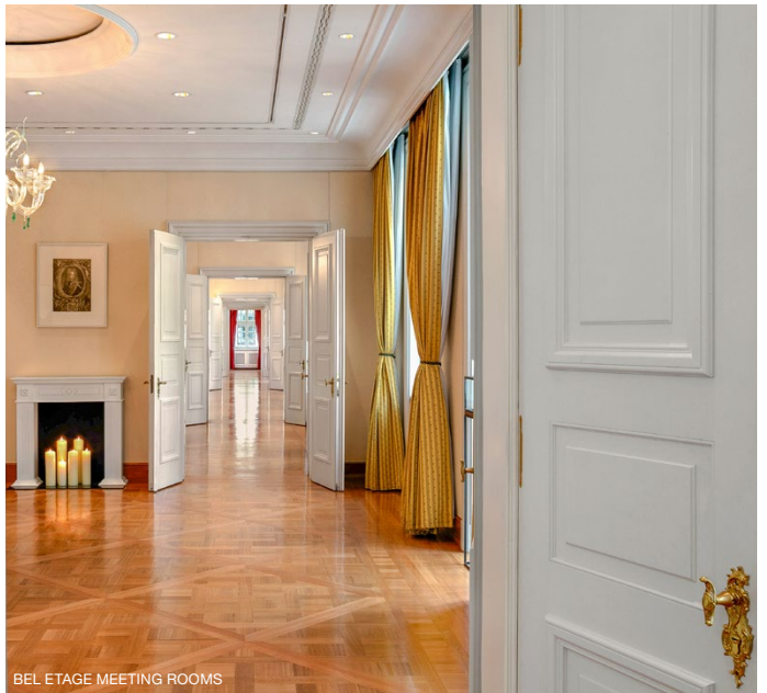
BEL ETAGE MEETING ROOMS